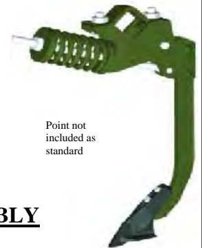
Point not included as standard