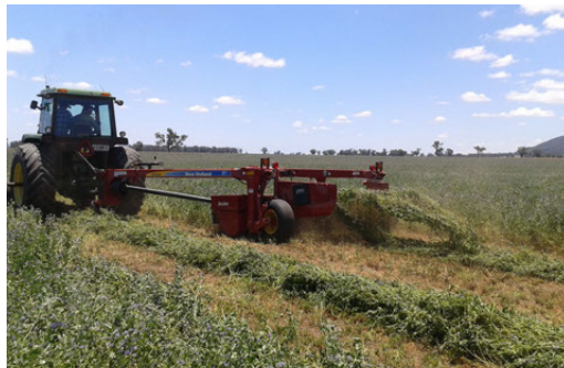
The New Holland H7230 in action