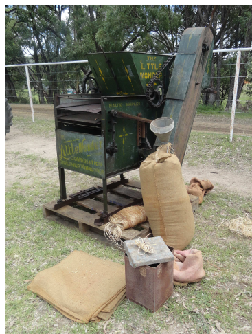
Baltic Simplex Little Wonder Combination Thresher Winnower