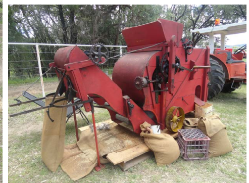
Horwood Bagshaw Winnower