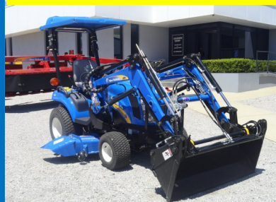
NEW HOLLAND BOOMER 1025

4WD, 26HP, Hydro Transmission, Challenge 4 in 1 FEL, Canopy, 5' Mid Mount Deck. $21,230 inc GST