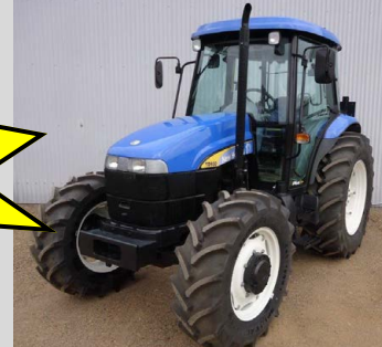
NEW HOLLAND TD95D

Full Warranty Incredible Prices 3 Units ONLY