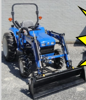
NEW HOLLAND T1510

4WD, 26HP, Hydro Transmission, Challenge 4 in 1 FEL, Canopy, 5' Mid Mount Deck. $21,230 inc GST