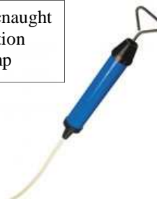
Macnaught Suction Pump

By carrying out this basic maintenance before the season, you are likely to get all of your work done on time, without breakdowns and costly repairs and downtime.