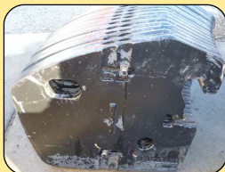
NEW HOLLAND FRONT WEIGHTS, off TG285, suits T8, T8000, other TG's $3,000.00 inc GST OR OFFER