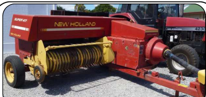
NEW HOLLAND SUPER 417 Small Square Baler $16,000.00 inc GST