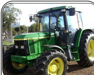
JOHN DEERE 6210SE, 90HP, FWA, A/C CAB, 16x16 Synchro Trans, Forward/Reverse shuttle, 3pl, 2 remotes. $36,300.00 inc GST