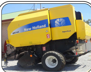
NEW HOLLAND BR740A Round Baler. This baler had had an extensive overhaul. New belts, chains and sprockets as required. $35,000.00 inc GST