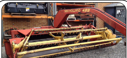
NEW HOLLAND 499 - offers considered Haybine Mower Conditioner

Looking for Parts? WRECKING AT TAMWORTH • New Holland BB940AP Big Square Baler • New Holland 317 Small Square Baler • SIP 470 Rake.