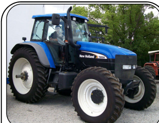
NEW HOLLAND TM190 190HP, FWA, Cab, 18 Speed Powershift, Super Steer Front Axle, 4 Remotes, 1900 hours. $99,000.00 inc GST