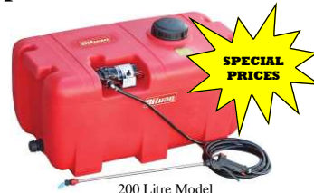
200 Litre Model

50L - WAS $519 100L - WAS $619 200L - WAS $729