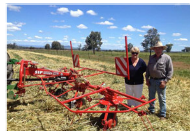
Ellis and Bev Watters - SIP Spider 555 Pro

spreading and turning the windrow out to the width of the Tedder from any size windrow for a more rapid dry down before using a traditional rake to pull it back into a windrow for baling. SIP Spider Pro models have been delivered to Ellis Watters at Curlewis with a 5.3m Spider 555 Pro and Craig Thomson at Boggabri has taken a 4.3m Spider 455 Pro.