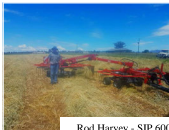
Rod Harvey - SIP 600/20

Rodney and Rose Harvey, new to the Loomberah district, have taken delivery of a SIP Star 600/20, a Twin rotor Side Delivery rake capable of raking 2 single rows or taking 2 rows into one. The Star 600/20T was in Rodney's opinion the most robust and best value he considered.