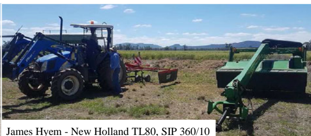
James Hyem - New Holland TL80, SIP 360/10