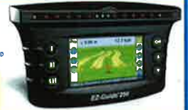
EZ-Guide 250 Display

The EZ-Guide 250 Display is an entry-level display providing high quality guidance capabilities at an entry-level price. It is ideal for farmers who desire basic precision agriculture functionality and lower-accuracy corrections. • 11cm widescreen colour display. Part No: ZTN92000-60, Ag 15 Antenna (Increases accuracy to 30 - 45cm pass to pass). Part No: ZTN92010-00