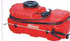
Silvan Redline 55 Litre Spotpak Sprayer $198.00