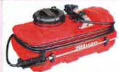
Silvan Redline 25 Litre Spotpak Sprayer $170.50