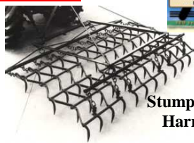
Stump Jump Harrows