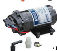
12 Volt SmoothFlo Pump 7 L/min Open Flow Can be retrofitted to most 12 volt Sprayers.