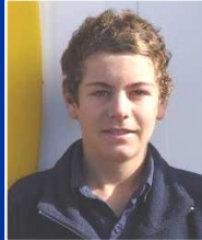
Cooper Patterson Gunnedah